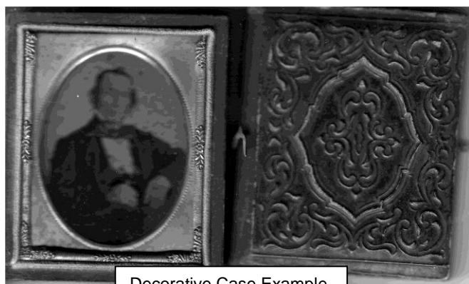
Decorative Case Example

Daguerreotypes are one-of-a-kind photographs on silver-coated copper plates, packaged behind glass. They have a grayish, mirror-like quality and change from negative to positive, depending on the angle at which they are held. Images are often laterally reversed because they are direct positives, so lettering on signs may be reversed and wedding rings may appear on what seems to be right instead of left hands. Color was sometimes added by means of gilding or pigments applied with small brushes. Introduced in 1839 by Louis-Jacques-